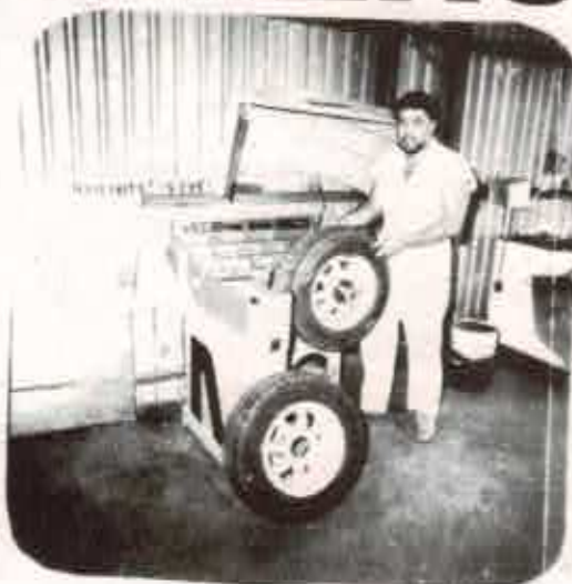
NORTRON COMPUTERISED WHEEL BALANCER — The most advanced wheel balancer in the world!

41 McLACHLAN ST., DARWIN (off McMinn Street) PHONE 81 9191